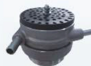
Rotary sprinkling plate