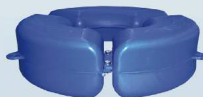
3 pieces coupled floater